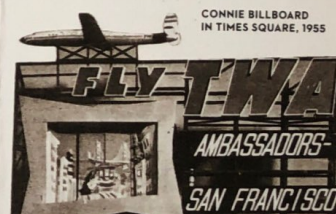
CONNIE BILLBOARD IN TIMES SQUARE, 1955

In 2018, MCR/MORSE Development partnered